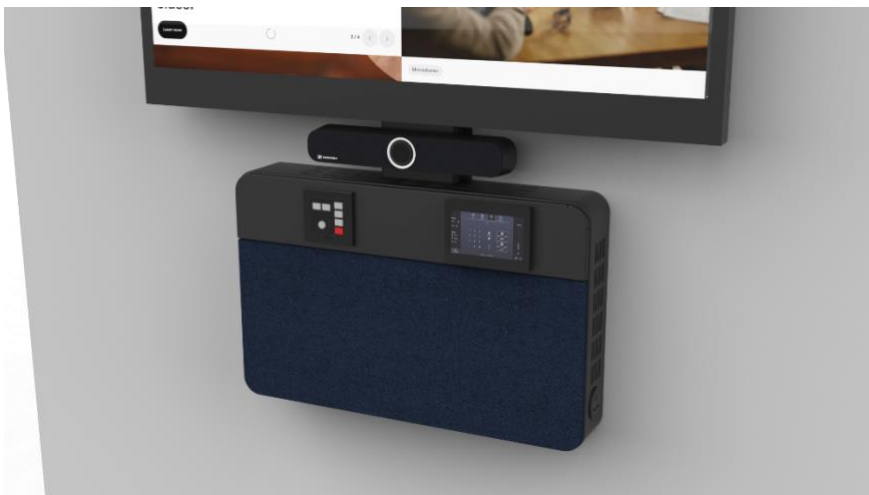
Closer look at TC Bar S with ALT

Ideal for corporate and educational environments, the ALT can be installed in meeting or seminar spaces. It can be positioned beside or below the primary display, serving as a central terminal for cabling and mounting hardware. This design ensures streamlined servicing and integration, making setup and maintenance both quick and efficient. When combined with the TC Bar Solutions, TeamMate can help improve meeting spaces through its stylish and functional AV furniture solutions.